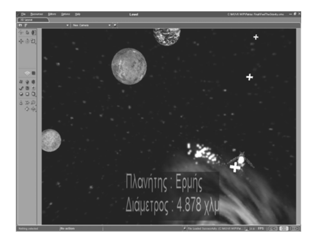
Figure 2: Feeling the gravity (Planet: Hermes Diameter: 4.878 km)

themselves. The user experiences the effect of the forces when accelerating objects (e.g. tries to throw them off their course) as well as the strength of the gravitational forces applied to objects at different distances from the sun or from a certain planet. Obviously, for the purpose of such an interaction the user is endowed with "super-powers". With the use of haptics the pupils are able to experience, feel and gradually learn the way the laws of simple mechanics are applied at the scale of our solar system. Figure 2 shows a screenshot of the application.