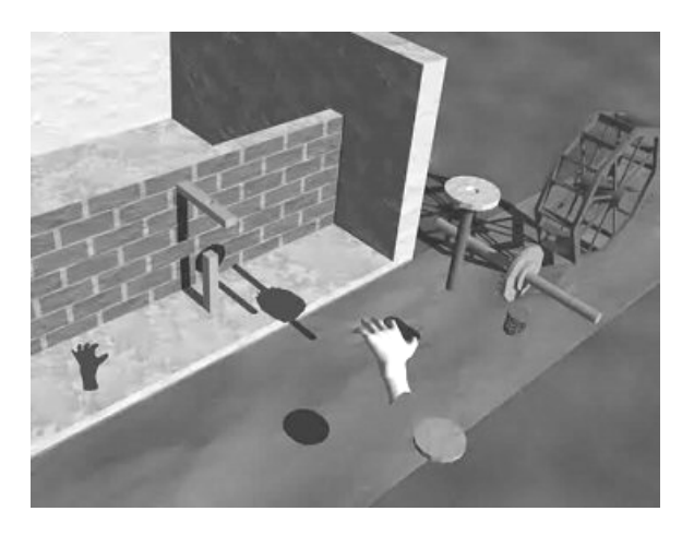
Figure 3: Assembling a windmill

Regarding the Virtual Model Assembly -Gears, the users are offered a lesson in the history of cogs, gears and their applications through the ages. They can also try to assemble some selected applications by combining gears. The users experience the effect of forces like weight, friction, motion, rotation etc. This application can be used to enhance students' understanding of phenomena like the transmission of motion from one part of a