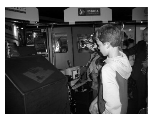
Figure 4: Laval Virtual demonstration, a young user

Students responded quite well to the use of this haptic prototype. Students were also pleased and seemed to be amused by their experience. They would wish to repeat their experience and to see the haptic device extend its abilities as well as to see it used in other applications too (more varied applications). For more information see [7].